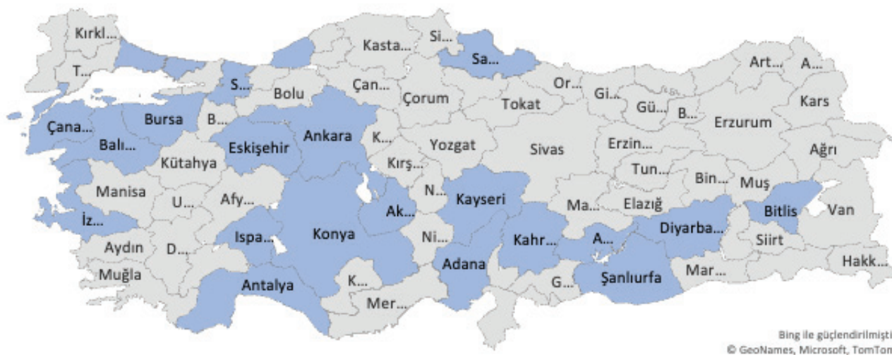
Figure 1. Cities in Turkey where seasonal DBPs monitoring is carried out.

using chlorine and chloramine as disinfectants in drinking water and wastewater samples [38]. A comprehensive investigation of NDMA formation was also carried out using different disinfectants in different water sources [39]. The studies in which NDMA formation potential tests were carried out in waters with and without wastewater interaction using chlorine dioxide and chlorine after pre-oxidation aimed to measure wastewater contamination in water resources [40]. The effects on the water resources affected by natural disasters in the USA and therefore on DBPs types (two C- DBPs and two N- DBPs) were investigated [41]. One of the most comprehensive studies completed in 2022, 4 THM, 9 HAA, 6 HAN and 9 HNM species in water distribution systems using different water sources such as Isparta, Antalya-Konyaalti, Antalya-Kumluca and the formation potential tests of 28 DBPs species in Egirdir Lake and Karaagaç Natural Water Source (Kumluca) have been tested for one year [42].