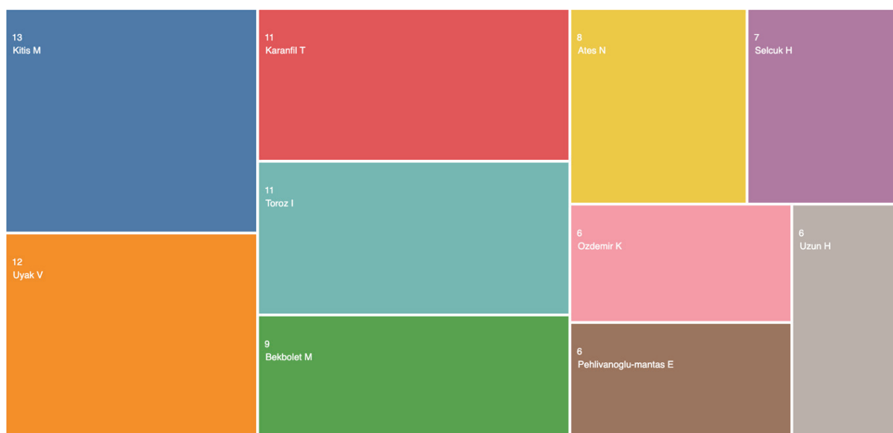
Figure 5. Number of articles published by the most productive authors.

Organic substances, inorganic substances, algal organic substances, and disinfectants such as chlorine, chloramine, chlorine dioxide and ozone must be present in the aquatic environment for the emergence of disinfection by-products [51]. Therefore, in DBPs control, either precursors should be reduced, or disinfectant doses should be reduced [52]. Along with the precursors of DBPs, studies for the simultaneous removal of endocrine disrupting chemicals and pharmaceutical personal care products have started [53]. In this context, it has been investigated that more than one pollutant group can be removed at the same time. Removal of algal organic matter (AOMs) that occurs as a result of eutrophication, a common problem today, has also been studied [54]. THM concentrations can be estimated in the developed multiple linear regression (MLR) models [55]. In this study, single-walled carbon nanotube and multi-walled carbon nanotube were added to the coagulation process as an innovative approach.