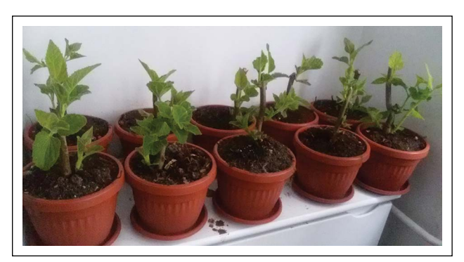
Figure 2 . Planting material, seedlings of Paulownia elongata.

There are a number of published papers that have the treatment of industrial waste as their object of research, i.e. its final purpose [15]. The goal of modern industry is to return as much waste material as possible to the process or recycle it [16]. Those materials that failed to be recycled or separated mostly end up in industrial landfills. One of the methods of treatment of industrial waste located in landfills is the possibility of planting biomaterials or bioremediation. The plant Paulownia elongata was used for experimental research. The plant is characterized by exceptional proper-