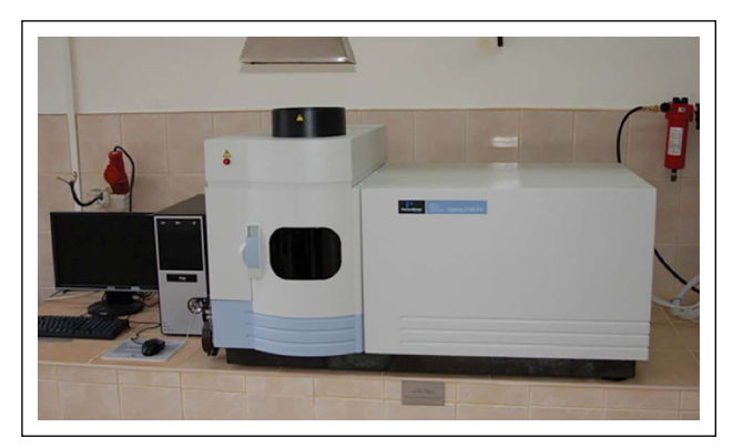
Figure 1. ICP-OES instrument.