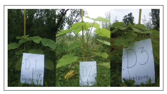
Figure 4 . Paulownia elongate seedlings on the substrate of industrial sediment "Black Sea".

ties, and it is especially worth noting the absorption of CO_2 from the atmosphere and the ability of bioremediation of contaminated soil [17, 18].