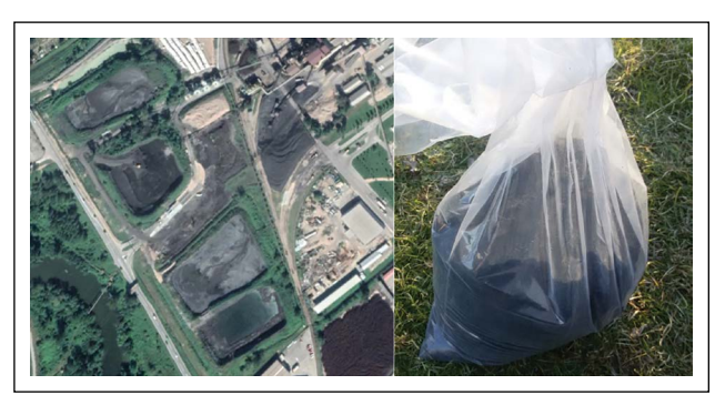
Figure 3 . Landfill and sample of the "Black Sea", location Lukavac Bosnia and Herzegovina.

tion, had the possibility of waste separation and application as a raw material component in cement production [10]. It is especially worth mentioning the applicable research in the formation of bio-parks on devastated areas in order to improve the environment in urban areas [11–13].